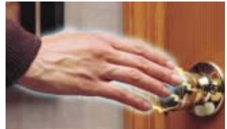
You can avoid those annoying shocks of static electricity this winter by adding a Carrier humidifier to your comfort system.

These features, along with our hard-earned reputation for delivering top-quality products make choosing a Carrier humidifier an easy choice. Once you choose Carrier, your local Comfort Control Specialist will analyze your system and help select the perfect humidifier model for controlling your indoor comfort.