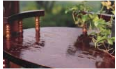
A Carrier humidifier helps protect your furnishings for years by preventing damage due to dryness, cracking and separating.

As warm, dry air passes through the humidifier pad, moisture is absorbed into the air and distributed throughout your home for a more comfortable indoor environment.